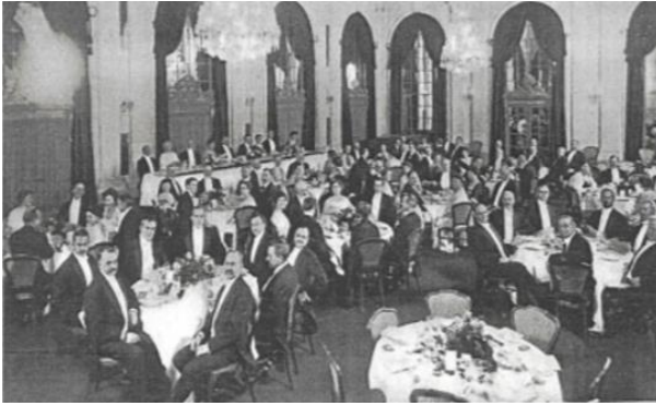
MMSA, Biltmore Hotel, March 9, 1914

Founded by 114 of the most prominent men in the natural resources world in 1908